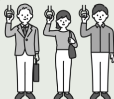
Riding the train