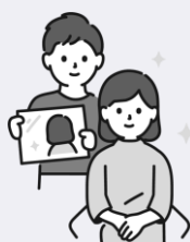
Going to the beauty salon