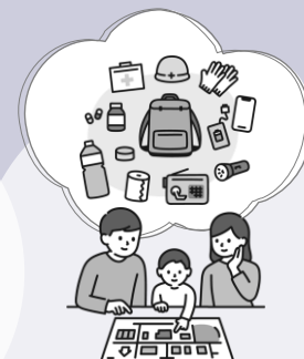
Preparing for disasters

You will also learn hiragana, katakana, and simple Kyoto dialect