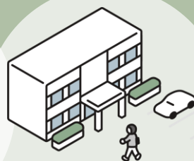
Going to the government office