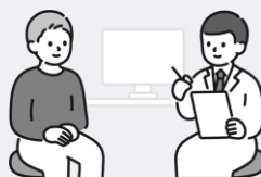
Going to the hospital